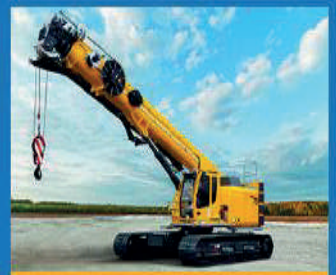
Crawler Cranes(50 - 3200 Ton)