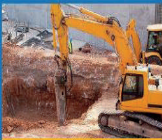
Earth Moving Equipments

We have the following fleet of heavy & light equipment's which are all certified according to SABIC and SAUDI ARAMCO standards.