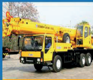
Mobile Cranes (30 - 1200 Ton)